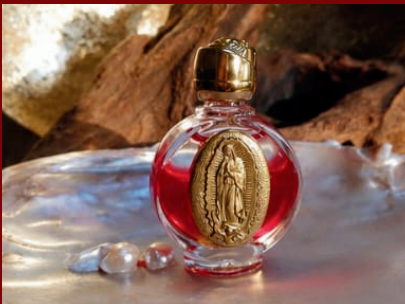
Mary Magdalene Oil